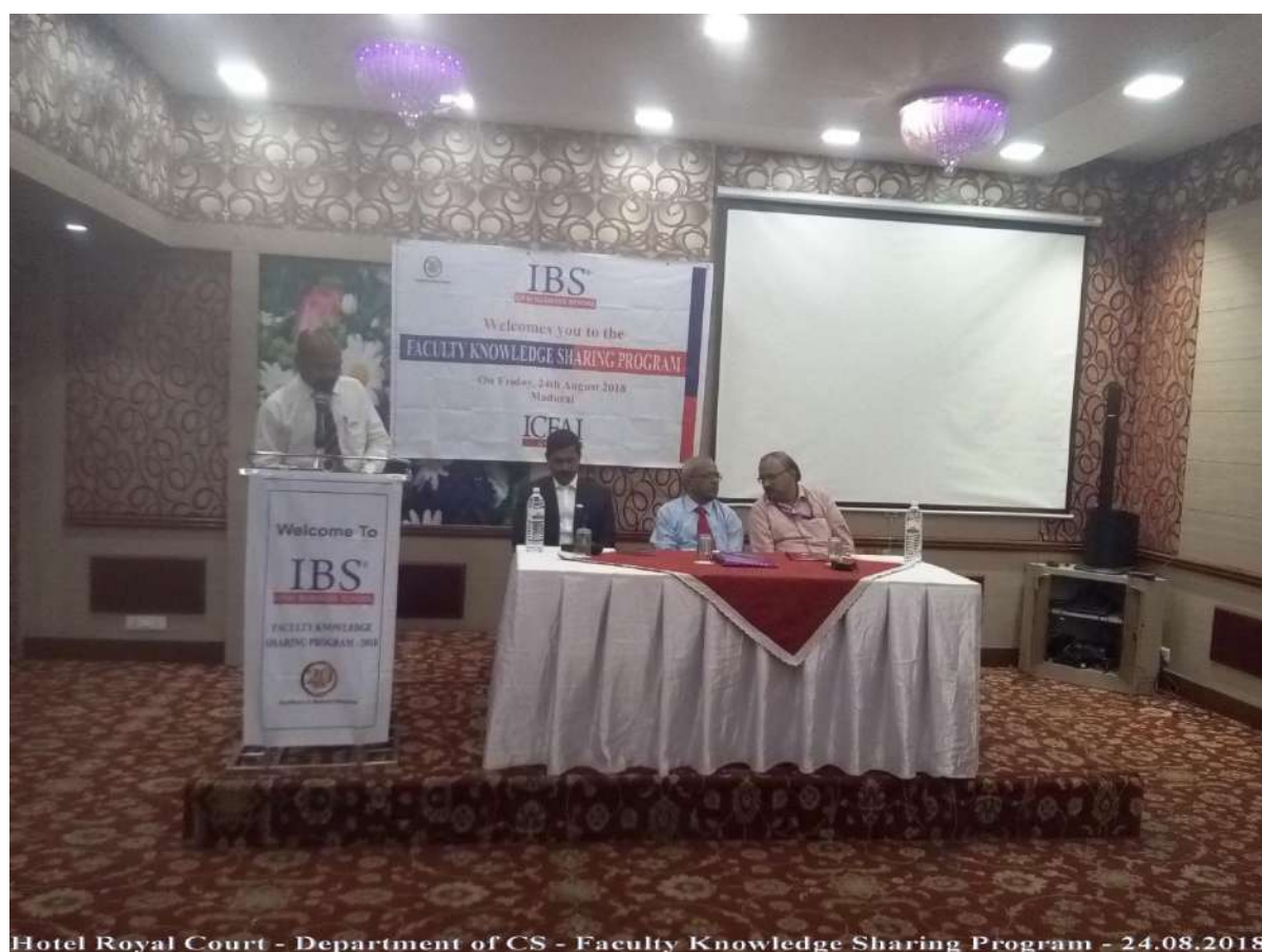
Hotel Royal Court - Department of CS - Faculty Knowledge Sharing Program - 24.08.2018