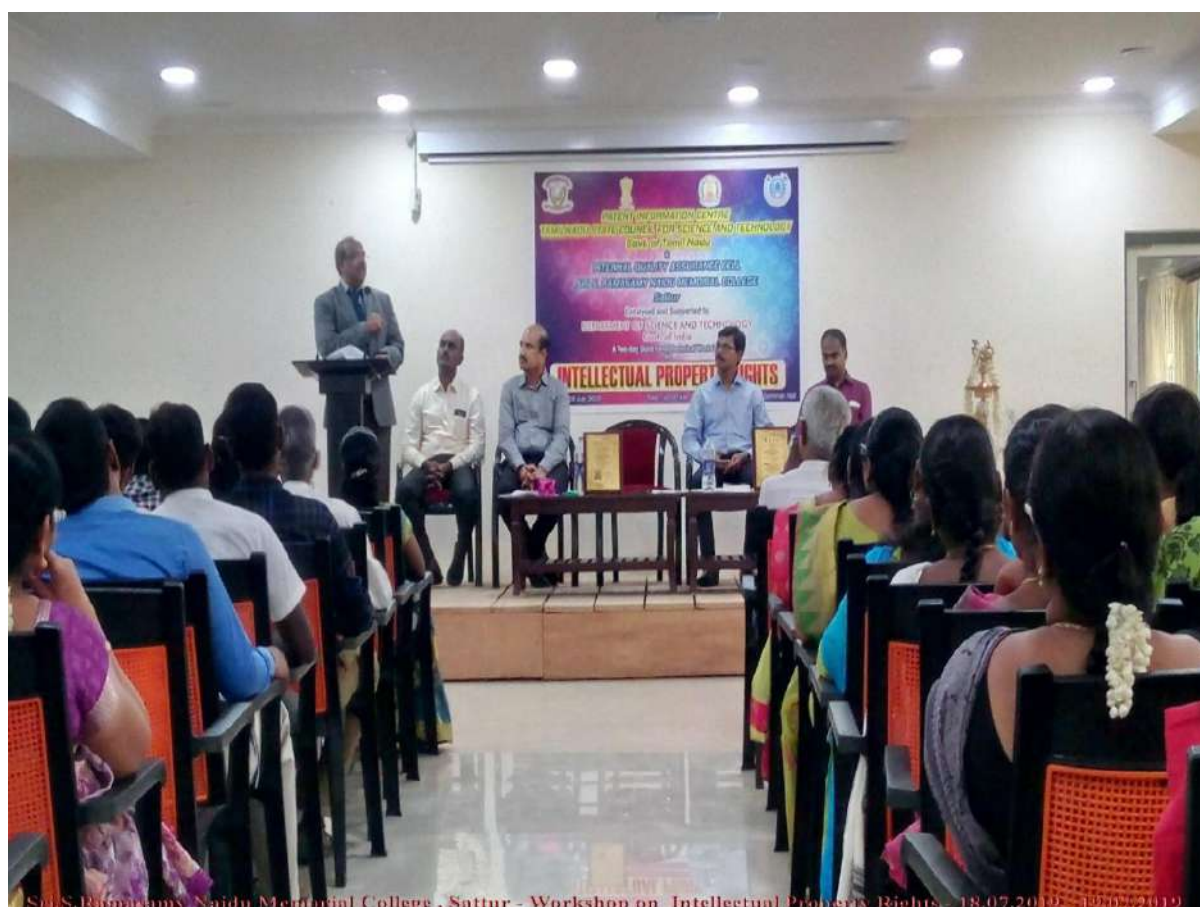
Sri S.Ramasamy Naidu Memorial College, Sattur - Workshop on Intellectual Property Rights - 18.07.2019 - 19.07.2019