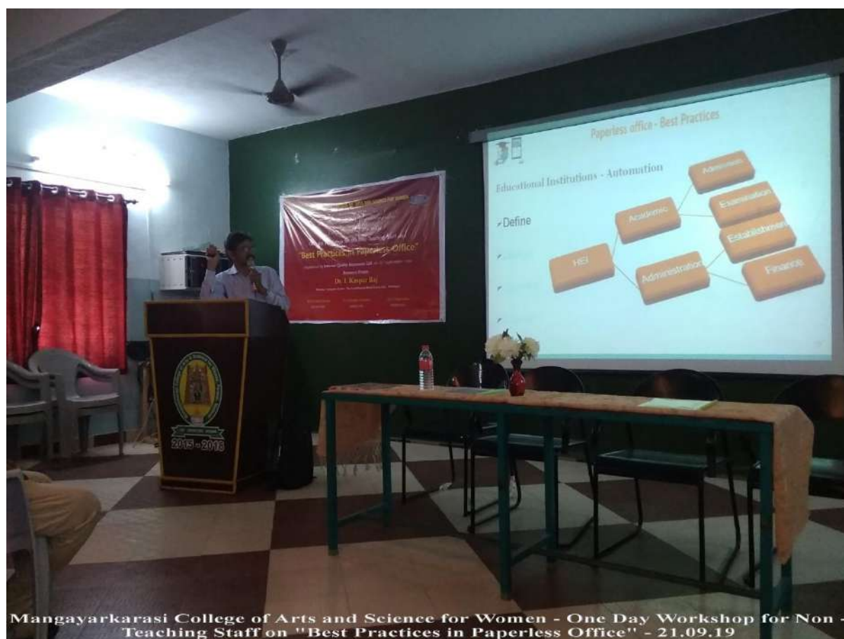
Mangayarkarasi College of Arts and Science for Women - One Day Workshop for Non - Teaching Staff on "Best Practices in Paperless Office" - 21.09.19